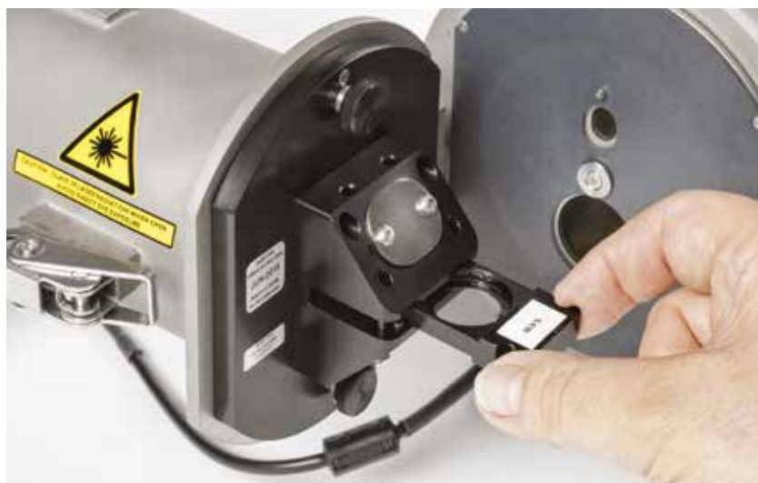
QAL 360 shown with a multi-value Manual Audit Unit and attenuator

The automatic contamination check system (patent pending) ensures that any optical variances are measured, defined and adjusted to ensure zero and span drift is kept to a minimum.